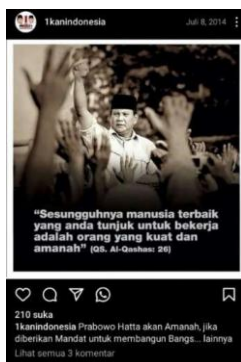
Figure 1 Prabowo's 2014 Look

In the presidential election to be held on February 14, 2024, Prabowo seems to have forgotten the symbols that were previously displayed. In terms of appearance or speech, he was known to be fierce, firm, and patriotic, like a proper former Lieutenant General of the Indonesian National Armed Forces. However, Prabowo Subiyanto has changed into a relaxed and entertaining person by demonstrating joget (which means 'dancing'), which is interpreted by the audience as joget gemoy . Gemoy (which means 'cute' or 'adorable') is an invitation to young voters to do cheerful politics (Mubarrod & Syarwi, 2024). To clarify the differences made by the political contestation carried out by Prabowo Subiyanto, it can be seen in the social media images below: