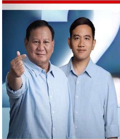
Figure 9. The Gesture of Two Fingers Pressed Between the Thumb and Forefinger is a Form of Love

The image above shows a two-finger gesture in which the thumb and index finger are attached to form a love shape. This kind of gesture is not uncommon among young people. Researchers see the gesture above as symbolic interactionism that has its meaning from a presidential candidate, Prabowo.