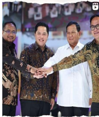
Figure 10. Event Welding diversity, Mr. Prabowo attended Mr. Erickthohir's Invitation to Celebrate Christmas with BUMN