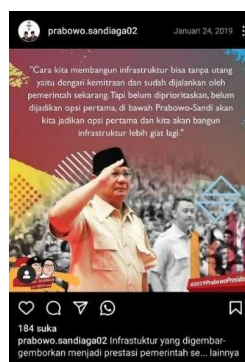
Figure 2 Prabowo's 2019 Look