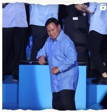
Figure 8. Joget Gemoy is an Example of a Phenomenon that is in Line with Mead's Paradigm

Mead considers the self to be an object for itself. An action is the result of intelligence that is united with experience. When an object is faced with an object, there is an organism that acts reflexively without self-awareness, only consciously. In social activities, the self or object will forget a little about its past experiences, which makes it difficult to involve its intelligence rationally. Joget gemoy is an example of a phenomenon that aligns with Mead's paradigm above. The researchers see themselves or objects being carried away by the atmosphere of the 2024 presidential election political activities.