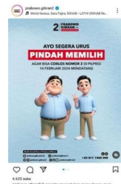
Figure 3 Prabowo-Gibran 2024 Animation