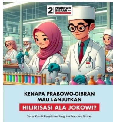
Figure 7. Downstream Political Movement

According to Nimmo, political direction is included in the party, which covers ideology, structure, and the vision-mission of candidates. The political movement downstream is a hot issue that political actors will echo.