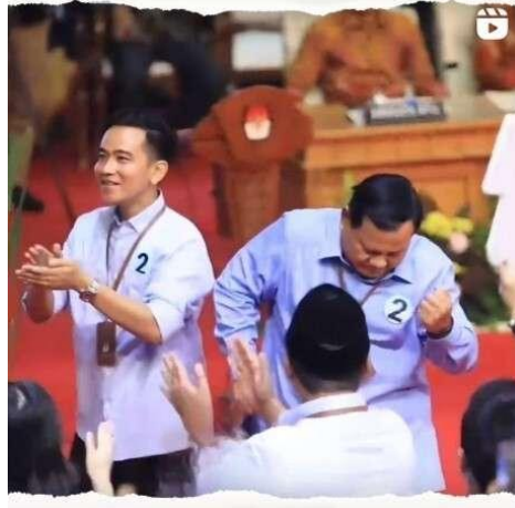
Figure 6. The Figure of Prabowo Candidate Who is Dancing Happily

The video above is a moment in the drawing of presidential and vice-presidential candidate numbers held on November 14, 2023. In the video, the researchers saw Prabowo coming down from the stage after opening the ballot number while showing his signature dance moves. The caption below the video is an Instagram caption that appears to be responding to the audience's response to Prabowo, who taunts and belittles him with a dance response that was taken into account.